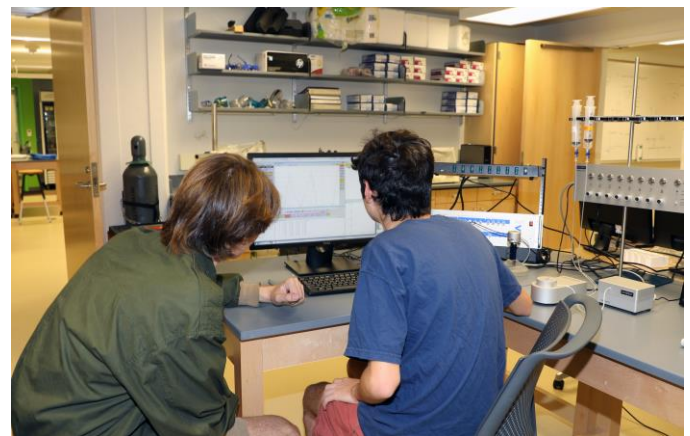
Dr. Kargol students: Understanding and analyzing ion channel functions

Using the Port-a-Patch® is straightforward and easy – the user simply adds solutions and cells onto the disposable recording chip, where a cell is automatically captured and sealed by suction using a computer controlled pump. Supported recording modes are the whole cell, perforated patch and cell attached configuration.